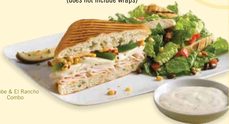
Adobe & El Rancho Combo

Choose any Signature Sandwich, Deli Sandwich or Panini (does not include wraps)